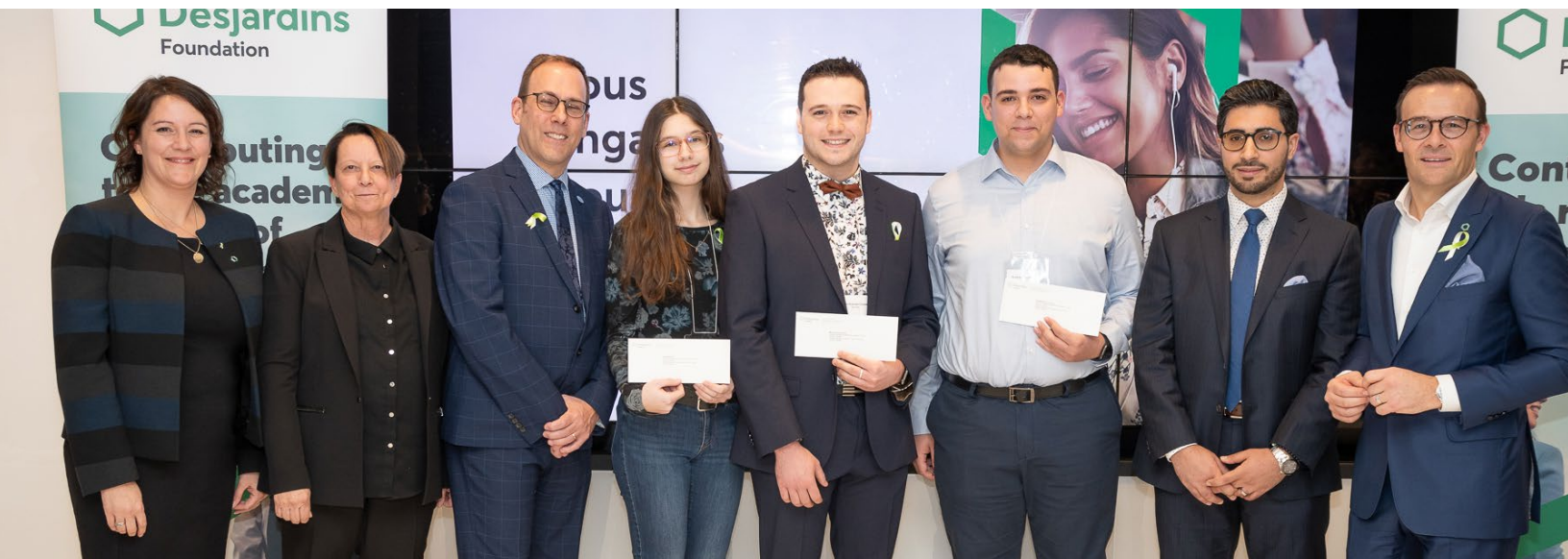
Scholarship presentation on February 17, 2020