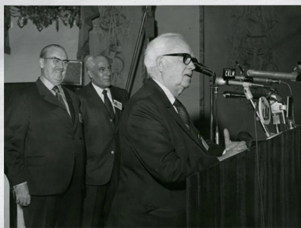
Émile Girardin, at the Foundation's launch in 1970