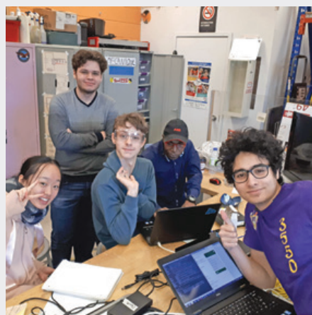
École secondaire Cavalier-De LaSalle