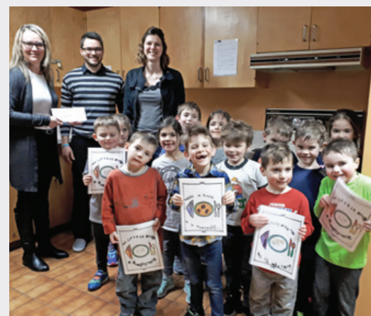
École de la Tourelle