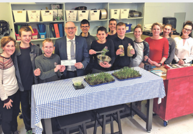
École du Triolet